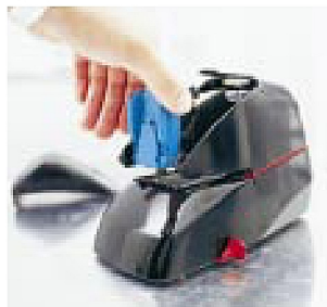
Staple cassette (5,000 staples) simplifies reloading. Cassette also contains all wear parts.