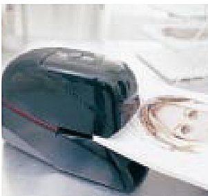
The R5080e is an efficient office and industrial stapler.