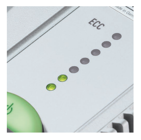
ECC - ELECTRONIC CAPACITY CONTROL This electronic feature indicates the used sheet capacity during shredding process to avoid paper jams.

Ease of operation: intelligent multifunction switch element with integrated optical signals indicating the operational status. Additional "emergency switch" function.