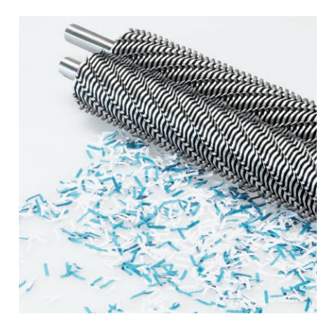
SOLID STEEL CUTTING SHAFTS Robust and durable: high-quality p

Robust and durable: high-quality paper clip proof cutting shafts with lifetime guarantee under conditions of fair wear and tear.