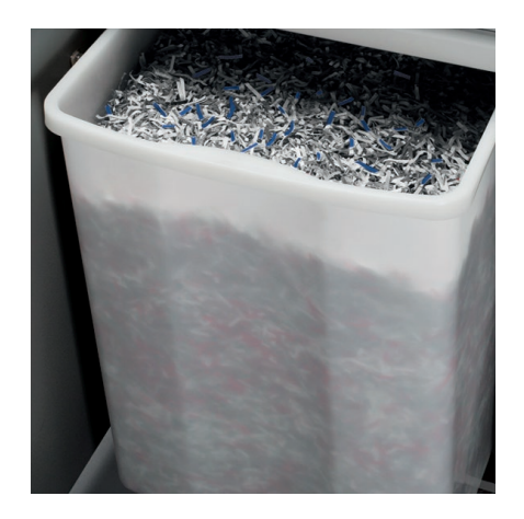
CONVENIENT SHRED BIN

Extremely safe: electronically controlled safety flap in the feed opening to keep fingers, ties or other objects away from the cutting shafts.